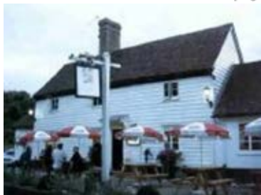
The Cabinet at Reed Sold to new owner

Featured here, and at our stand, are a few of our 'Save our Pubs' campaign successes and those that still need our support.