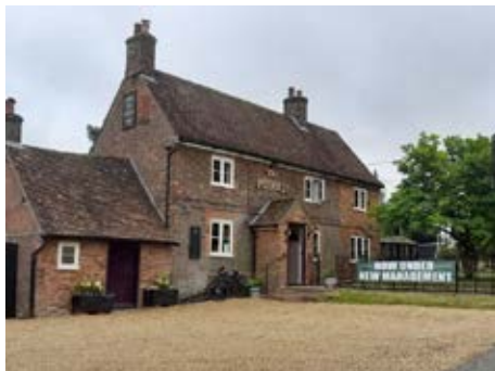
Three Tuns Great Hornead Re-opened September 2025