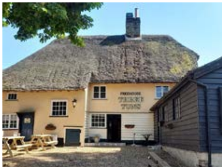
The Plough at Kings Walden Saved in May 2024