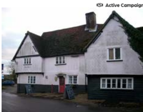
The Bell at Benington Closed