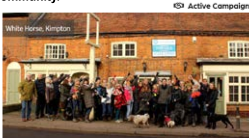
The White Horse, Kimpton Closed

This is all within our vision of quality real ale, cider and perry and thriving pubs in every community.